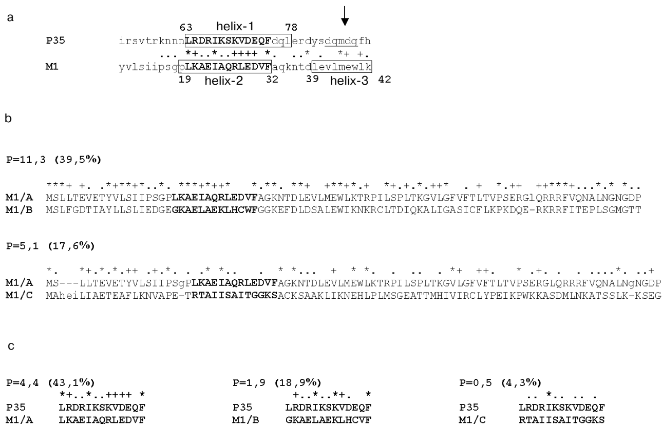
Fig. 3. A comparison of the structures of M1 protein from influenza A, B, and C viruses and p35 baculovirus antiapoptotic protein. A comparison was performed in a pairwise multiple sequence alignment program [26]. Dot, plus, or star symbols above the aligned amino acid pair show the ranges of similarity score: 1SD below the average value of Johnson's matrix (-), or 1SD (+) and 2SD (*) above that one, respectively [26]. a) Partial pairwise alignment of M1 protein from influenza A virus (A/FPV/34 [28]) with p35 protein from Autographa californica [29]. A region containing a homologous supermotif is presented. b) Full pairwise alignment of M1 protein from influenza A virus (FPV) with M1 proteins of influenza B/Lee/40 virus [30] and C/Mississippi/80 [31]. First 90 amino acids of M1 protein from influenza A virus are shown. c) Similarity analysis of amino acid regions 63-75 of p35 protein and 20-32 of M1 protein from influenza viruses of three different types. Coefficients of power (P) illustrating the degree of "non-coincidence" of similarity [26] and a percentage number of positions bearing homologous amino acids (%) in the sequence of analyzed region of the molecule. Primary structures of M1 and p35 proteins are recorded in single letter format. The figures above indicate the amino acid numbers in the analyzed sequences. Homologous region (supermotif) is marked with bold font. \alpha -Helix regions are numbered beginning with the N-terminal region and placed within a frame; an arrow shows pentapeptide in p35 (underlined) that is involved in the interaction with caspase catalytic site [32].

With respect to the discovery of caspase-8-binding properties of influenza A virus M1 matrix protein, we carried out a computer search for structural analogies of viral M1 with other known apoptosis inhibitors. Special attention was given to the antiapoptotic proteins from the caspase inhibitors group. The preliminary analysis (Fig. 3) revealed a structural similarity of the N-termi-